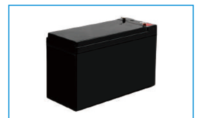
Lead Acid Battery