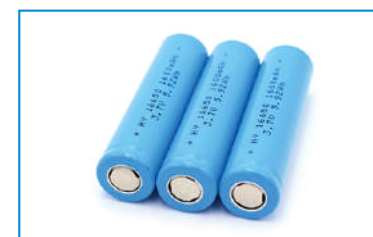
Ternary Lithium Battery