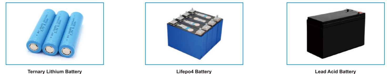
Ternary Lithium Battery