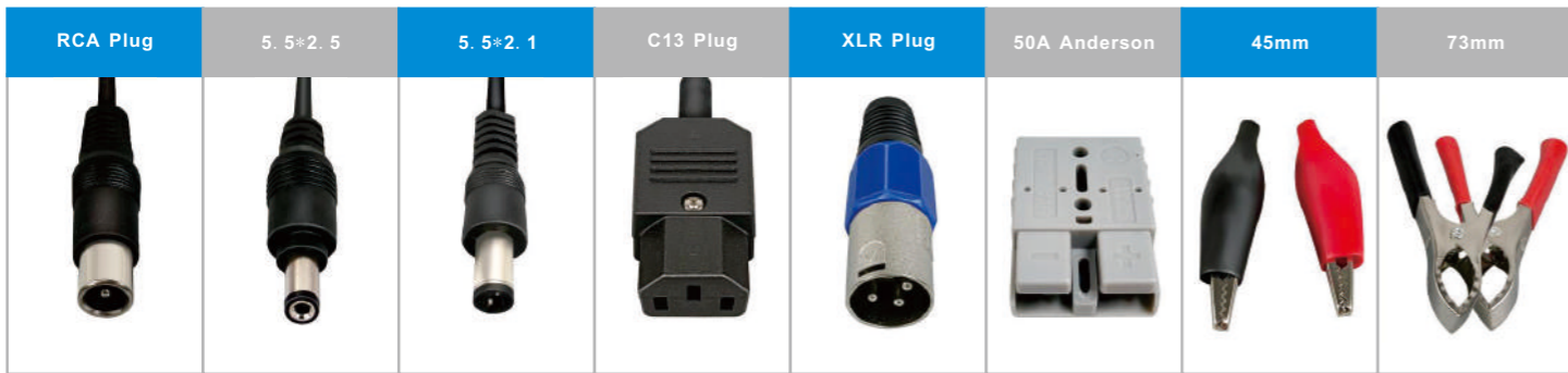
RCA Plug 5.5*2.5 5.5*2.1 C13 Plug XLR Plug 50A Anderson 45mm 73mm