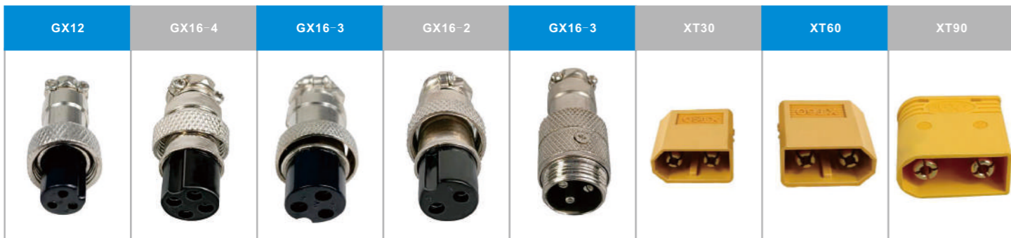
GX12 GX16-4 GX16-3 GX16-2 GX16-3 XT30 XT60 XT90